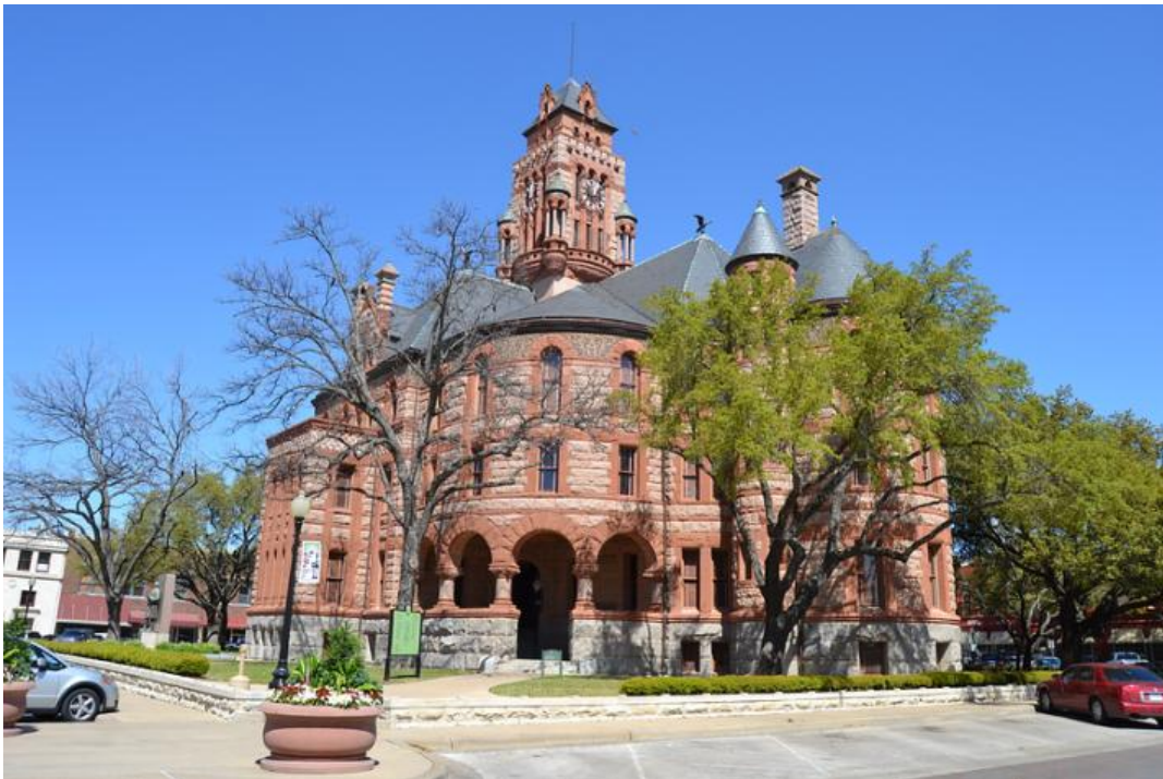
Mar 2016 Heading: S