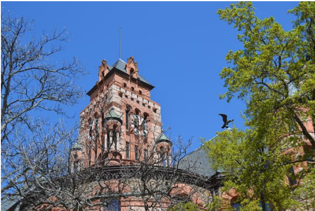
Mar 2016 Heading: S