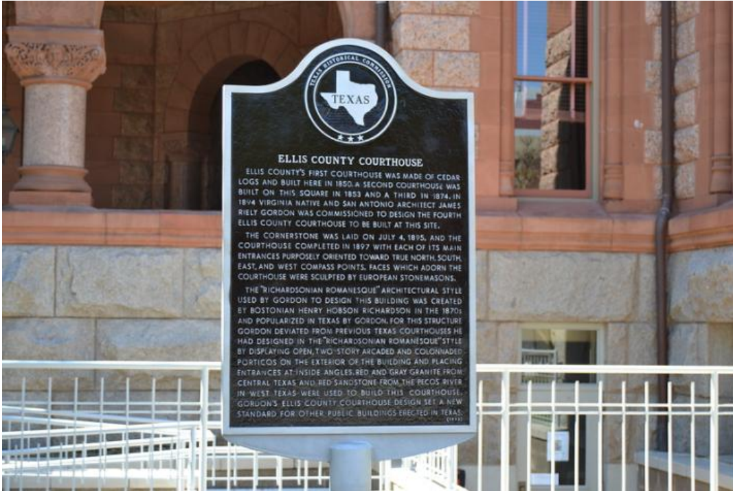
Mar 2016 Heading: S