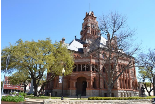
Mar 2016 Heading: SE