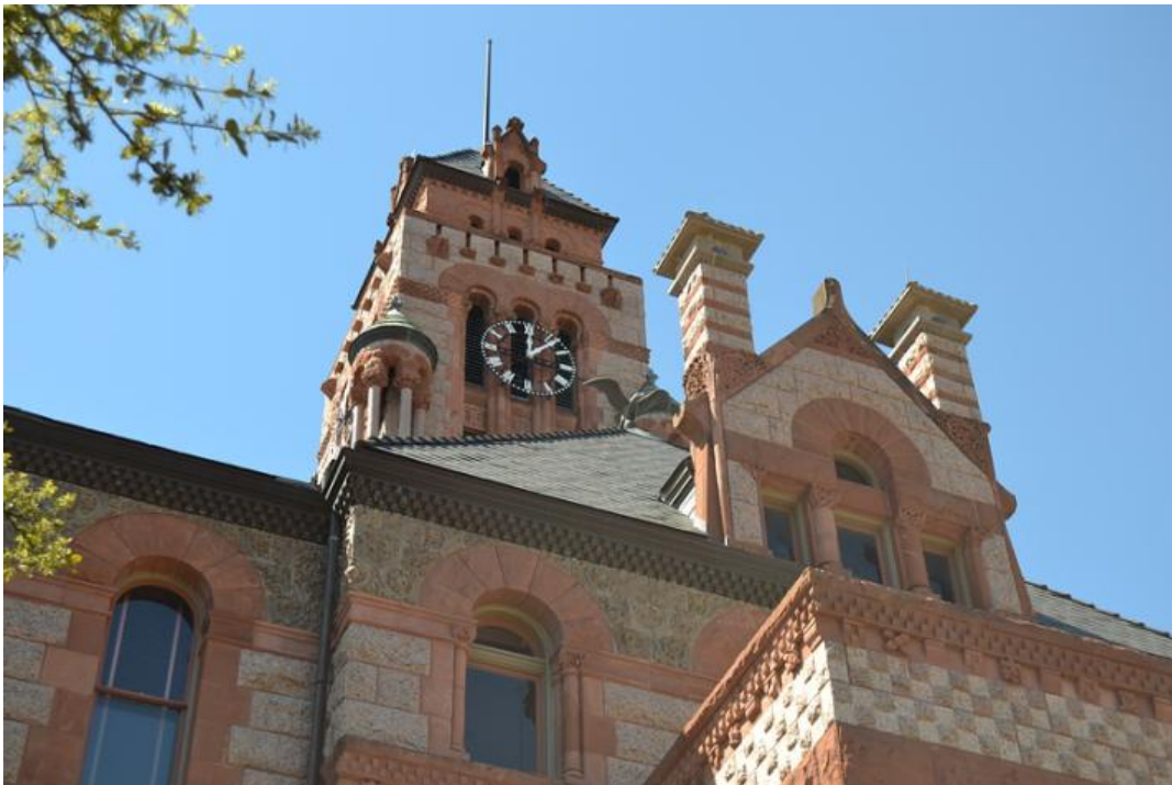
Mar 2016 Heading: SW