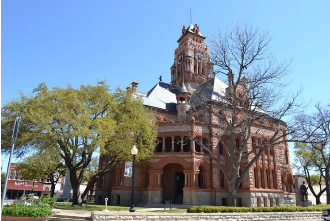
Mar 2016 Heading: SE