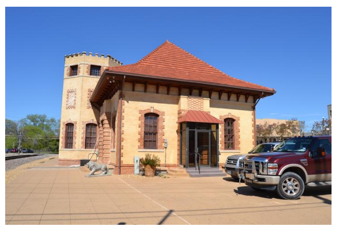
Mar 2016 Heading: S Image ID 20194