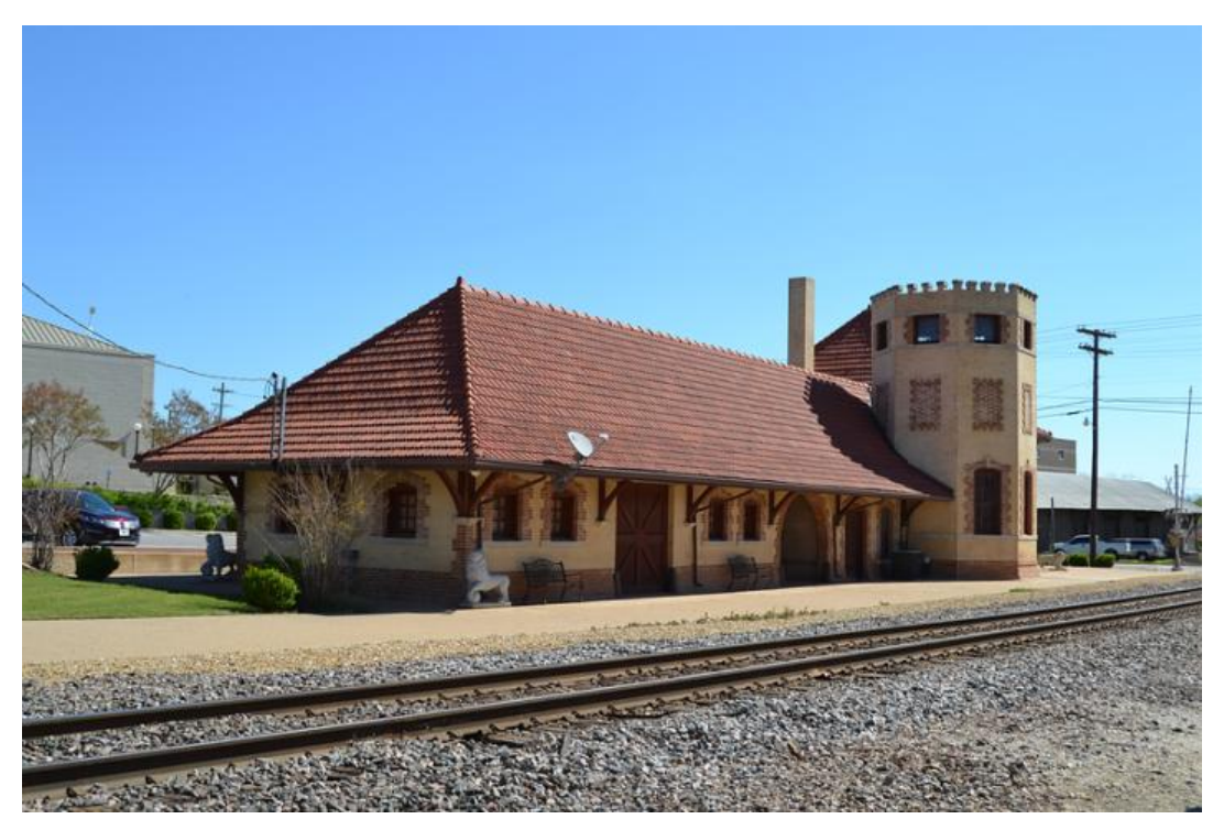
Mar 2016 Heading: SE Image ID 20192