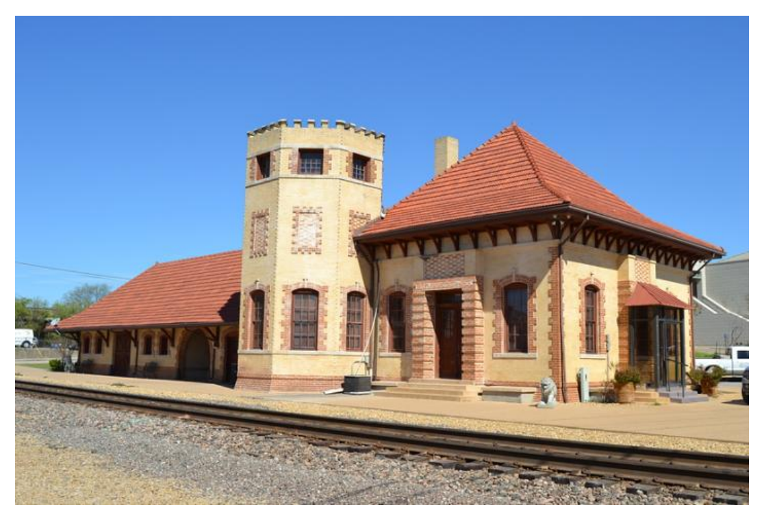
Mar 2016 Heading: S Image ID 20193