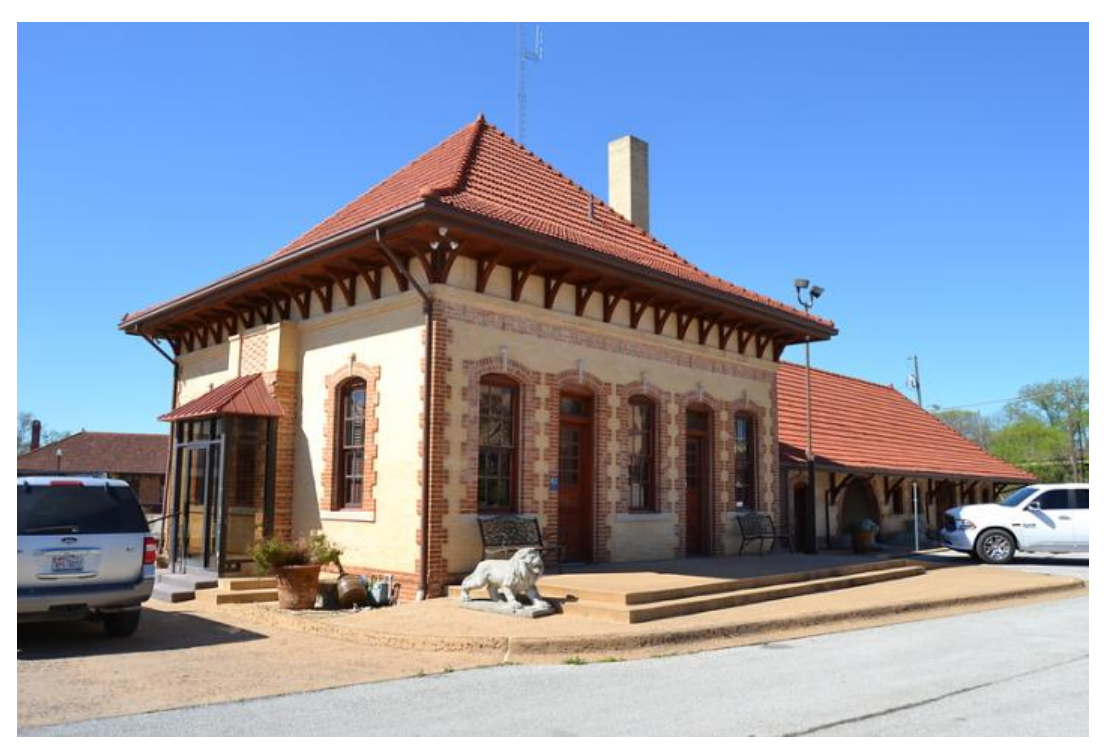
Mar 2016 Heading: S Image ID 20195