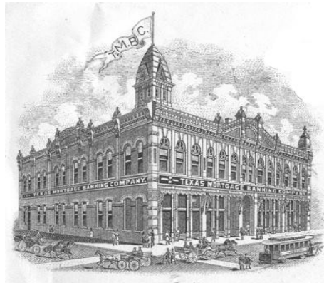
The Odd Fellows Building on the corner of Main and College. The building burned in November 1911